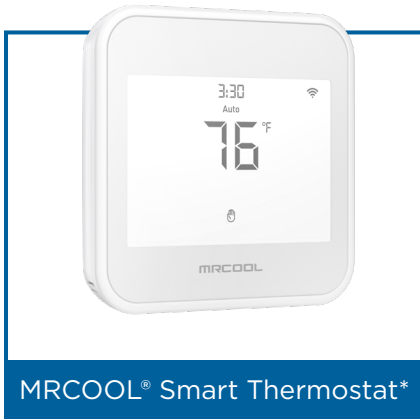
MRCOOL® Smart Thermostat*