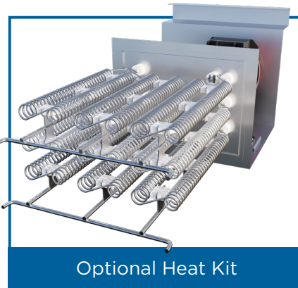
Optional Heat Kit